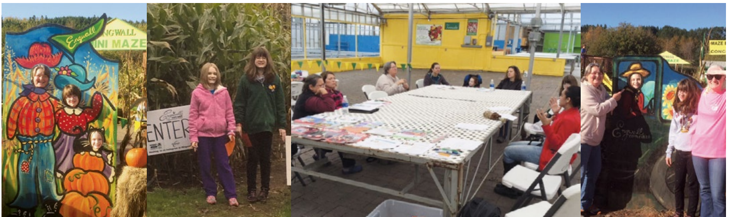
Sixth Annual MNH&V Family Event at Engwall's Corn Maze in Hermantown, MN (NE Region). The topic was Social Media and Bullying.