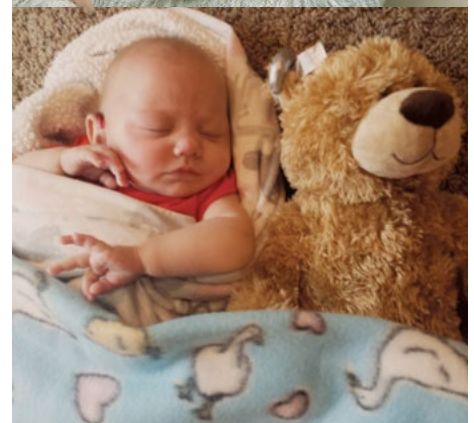
Welcome blankets and teddy bears recently delivered to our newest MNH&V families across Minnesota.