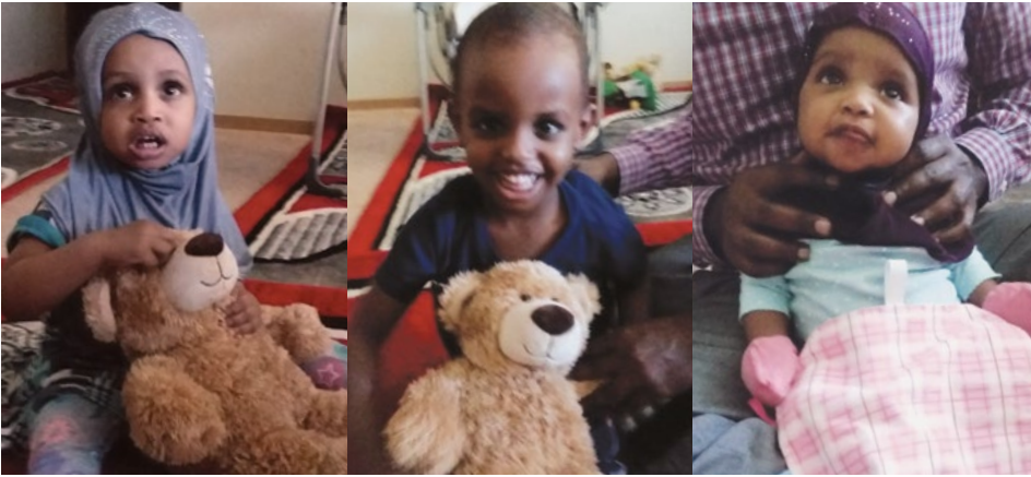
New MNH&V family, all three children newly identified as dhh in varying degrees, received welcome blankets and teddy bears on a recent visit from a MNH&V Parent Guide.