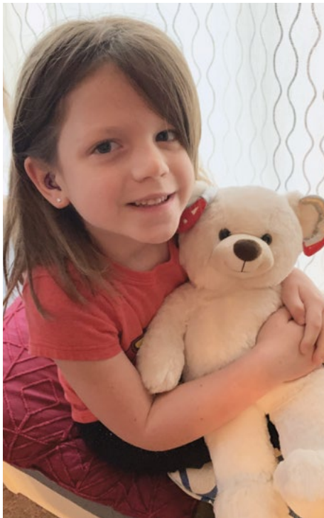
One happy Metro area teddy bear recipient.