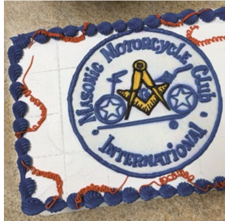
Cake with an exact likeness of the MMCI#24 logo, made by one of the members to share at the potluck dinner.

Thank you to the Minnesota Masonic Motorcycle Club International Chapter #24 (MMCI#24) for their generous donation to Minnesota Hands & Voices (MNH&V). MMCI#24, organized in 2000, has donated to MNH&V in the past and donates exclusively to organizations that are locally funded. Their donations have gone towards MNH&V's events that support the social emotional needs of our families and especially their children who are deaf or hard of hearing.