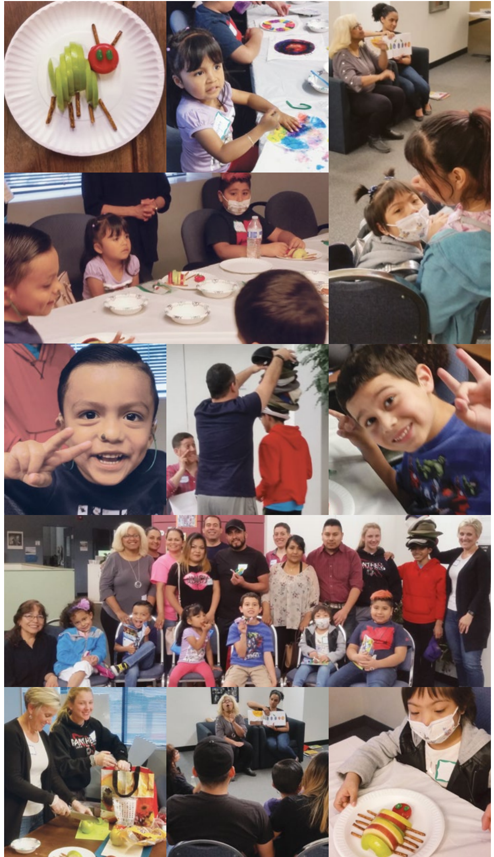
Raising Readers Event for the MNH&V Spanish Speaking Community, on May 19, 2018, was held at Lifetrack in St. Paul, MN. Interactive activities, healthful-snack, crafts, play acting, and interpreters in Spanish and American Sign Language brought to life two classic stories, The Very Hungry Caterpillar by Eric Carle and Caps for Sale: A Tale of a Peddler, Some Monkeys and Their Monkey Business, by Esphyr Slobodkina.

Help us spread the word to other families, professionals, and educators that MNH&V is committed to providing support and information to families with a child who is dhh at any stage of their journey.