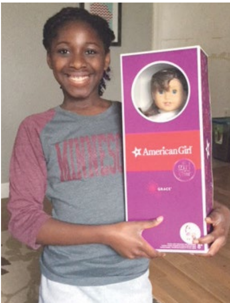
Welcome to MNH&V's newest friend from greater Minnesota. Adopted from the Congo, our young friend was given a choice of welcome gifts. She was delighted to pick the American Girl Doll, saying, "She cooks!" Our friend had seen a movie about the American Girl Doll and was familiar with her story. Plus, it included a book!