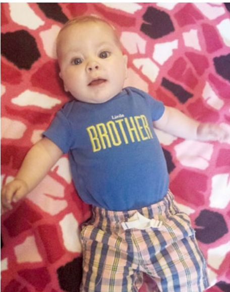
Welcome blanket recipients from Central Minnesota.