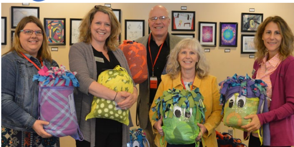
Welcome blankets in cute little mesh bags were donated to MNH&V made by the staff at Eagle Valley Bank.