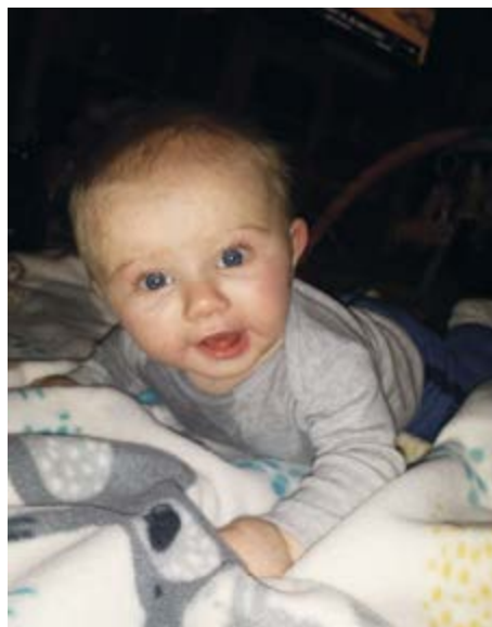
The latest welcome blanket recipient in greater Minnesota