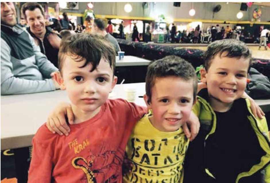
Friends and their fathers reconnect at the 2016 MNH&V Family Roller Skating Event this past January.

Reading about different communication opportunities and all the choices available for children who are DHH can sometimes be overwhelming and seem abstract. Sometimes your family of origin, the culture of your ethnicity or your faith can color the decisions you make for your family. A family-to-family connection can be a great way to see the possibilities first-