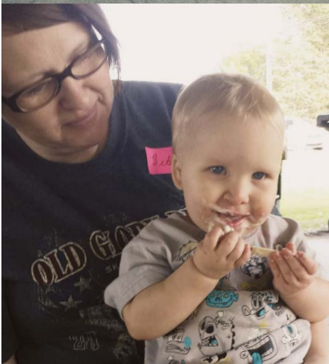
MNH&V Popsicles in the Park event in Sauk Centre, MN on July 8, 2015