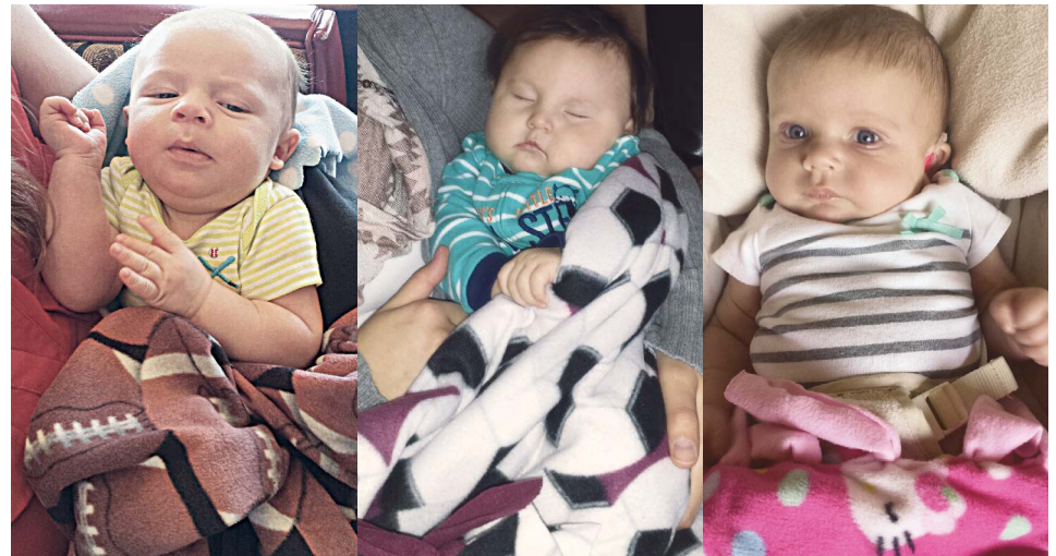
Three of the latest little ones to receive welcome blankets delivered by MNH&V Parent Guides in greater Minnesota. The blankets were hand-made with material generously donated by Unitron.